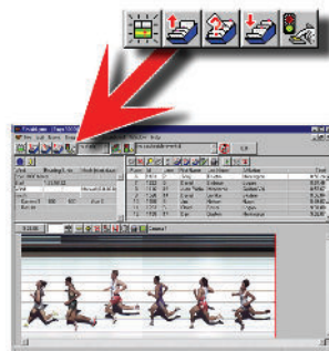
Figure 1 Start Selection Icons

A new blank Event window will open and the new event name, using the date and time ("130812-110515") will appear in the "open event" listing in the menu bar.