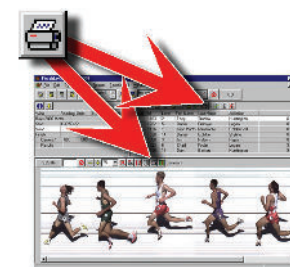
Figure 6 Print Icons

If required, after the image has been processed and the race has been saved, print the results by clicking on the Print Results icon .