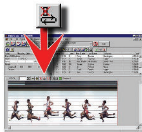
Figure 5 Autocrop Icon

Reduce the image file size and help speed up the time to evaluate the results by cropping blank space. Remove all the blank space between competitors by using automatic cropping, or with the manual cropping function.