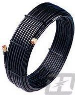
G. Access Point Pigtail (3' thin)