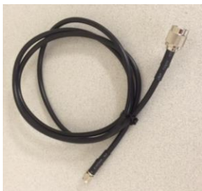
G. Access Point Pigtail (3' thin)