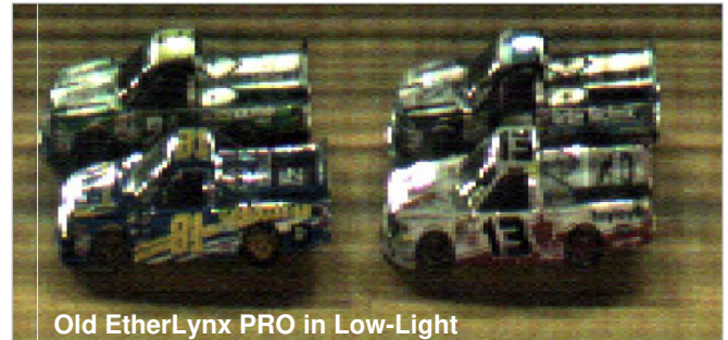
Old EtherLynx PRO in Low-Light