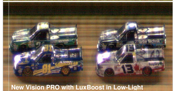
New Vision PRO with LuxBoost in Low-Light