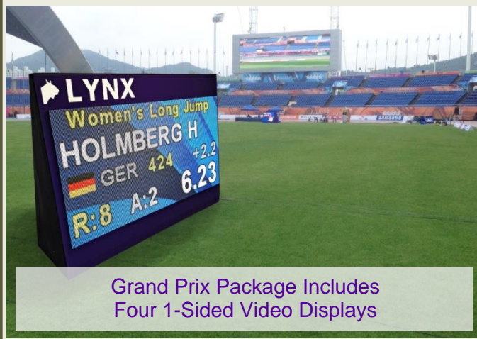
Grand Prix Package Includes Four 1-Sided Video Displays

Field event marks are entered into FieldLynx on a netbook computer and then the ResultTV software outputs vector graphics directly to the video board. Athlete names, performances, rankings, and other event info can be sent directly from the netbook using ResultTV to display dynamic, high-visibility graphics. Choose from a number of default templates or customize your graphics for the event by adding custom colors, images, logos, or GIFs.